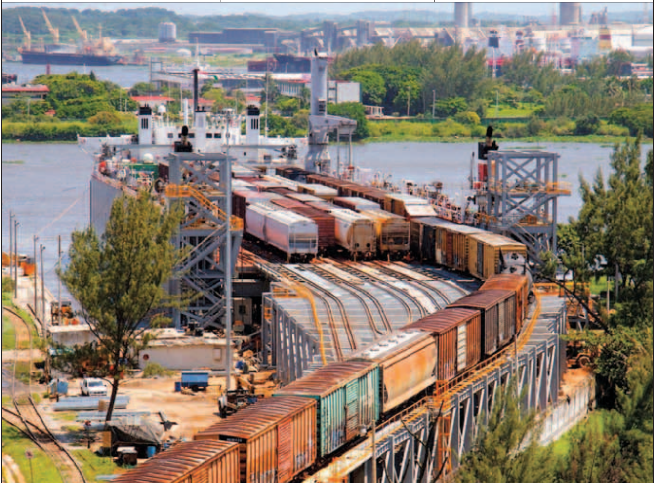
As oil prices continue to rise, many chemical providers and shippers are turning to alternate transportation methods, such as rail and intermodal, to help reduce costs.

“The capability already existed in IBM’s solution, and it easily