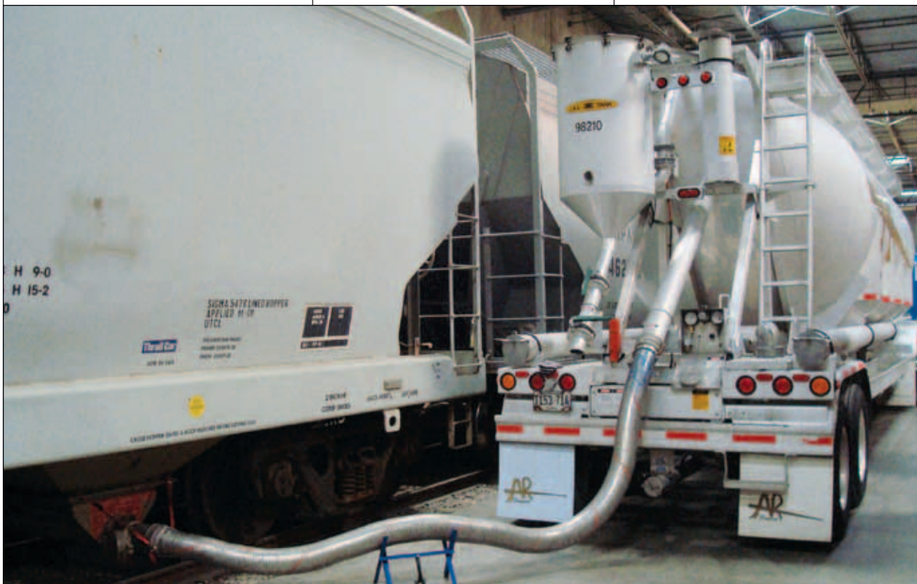
After establishing itself as a leading provider in the bulk plastic transportation market, A&R Logistics has expanded to serve shippers of dry, flowable, and liquid commodities – including chemicals – domestically and internationally.

Securing over-the-road transportation capacity, for example, is a major concern for chemical