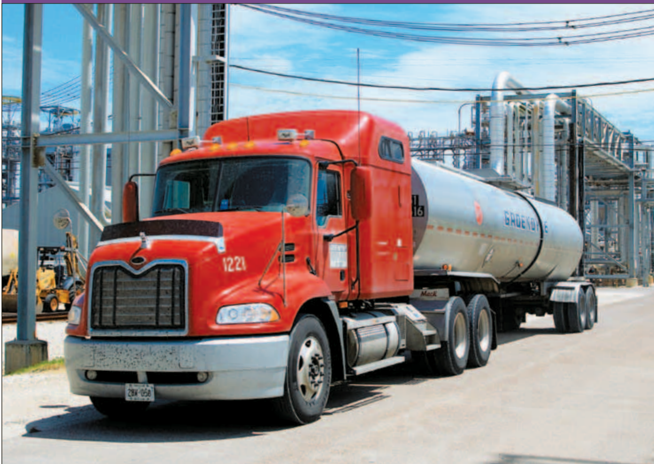
Bulk transport carriers are still not sure what effect the FMCSA's Hours-of-Service rules and the CSA 2010 safety program will have on operations and capacity.